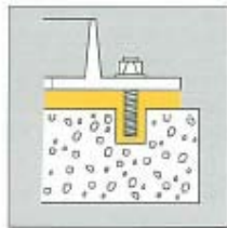
Machine Base Grouting

Sika Grouts can be used to fill the voids between a given substrate (usually concrete) and machinery baseplates, equipment baseplates, anchor bolt holes, bearing plates, prefabricated columns, rails, and tilt-up panels. Grout can also be injected into surface cracks, or used for waterproofing or repair work.